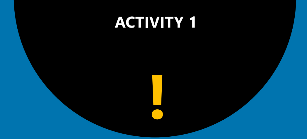
Activity 1 - You cannot hear what someone says

Your instructor will say something to you. Pretend that you could not hear. Deal with this communication problem using the phrases introduced in this workshop.